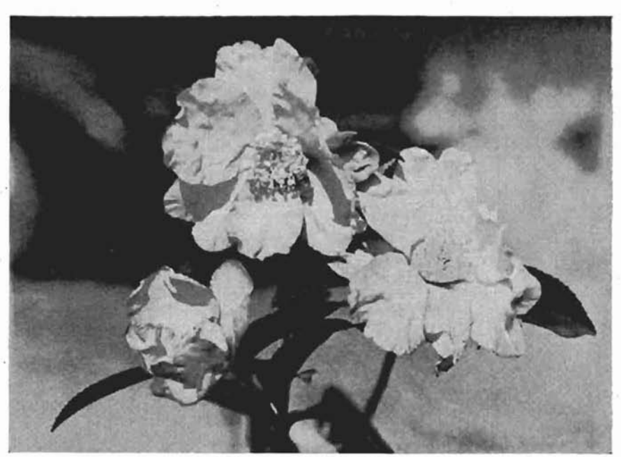
C. sasanqua 'Splendor'

It is my opinion that the sasanguas are truly one of the most colorful groups of flowers in the camellia gardens today. It is indeed unfortunate that they are not more appreciated. In many cases by the time the camellia fancier is aware of the japonica season, the sasangua has most likely finished blooming or near its end. When the camellia fancier gets into the spirit of things (camellia spirits, please) and visits his nursery friends to talk shop and see the new japonica varieties, he is not even aware that the sasangua exists. If he only knew it he could have a much longer camellia season and most surely an early one by owning a group of top sasangua varieties. Also, the sasangua is to be enjoyed for the profusion of its delicate blooms, an effect that is most enlightening. The sasanqua is surprisingly hardy when grown in full sun. This is proven without a doubt by seeing sasanqua beds in full sun at the home of the very gracious