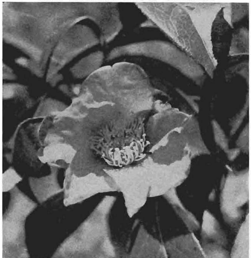
A charming view of C.\ rusticana , wild form. The picture was taken at Oguni, Yamagata Prefecture, Japan.