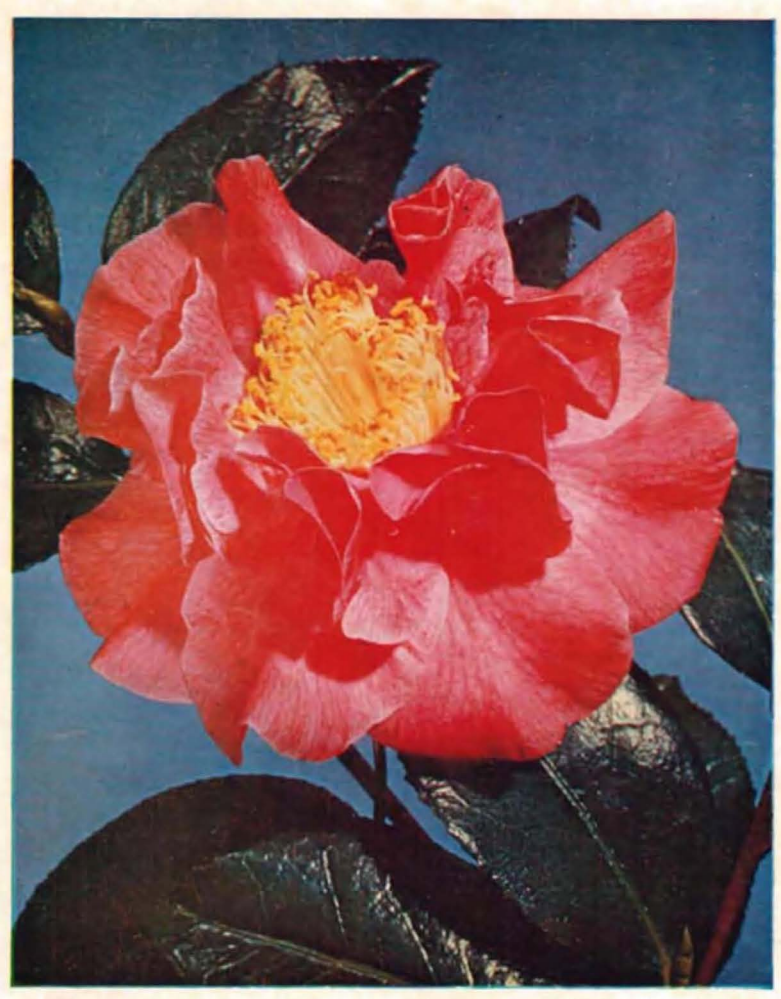
C. japonica 'Guilio Nuccio'

A Publication of the Southern California Camellia Society