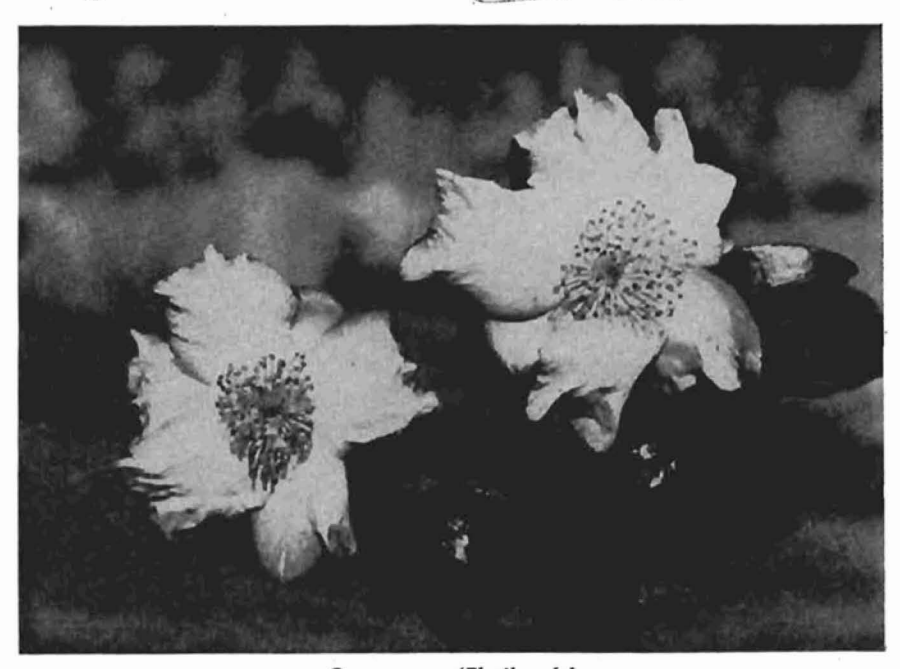
C. sasangua 'Floribunda'

A step in the right direction can be found in the hybrid 'Donation.' Here is at least a hybrid that can produce flowers of good size. A single to semi-double of delicate pink with lilac overtone. The flowers are best enjoyed on the plants. Picked for arrangements or for exhibition, the flowers will last a short time and wilt easily. The big fault with this hybrid is that the flower cannot stand heat. 'Donation' is